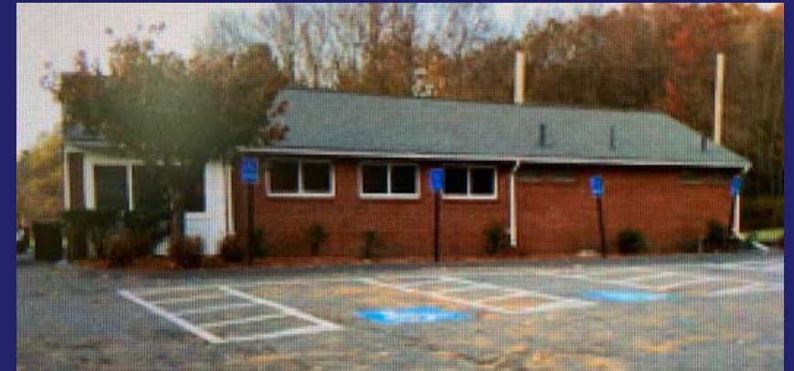
Pine Meadows Clubhouse