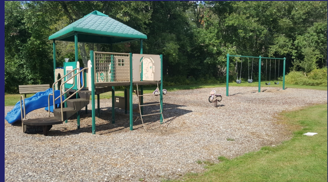
Justin Park Playground

CPC Category: Recreational Resources CPC Vote: (9-0)