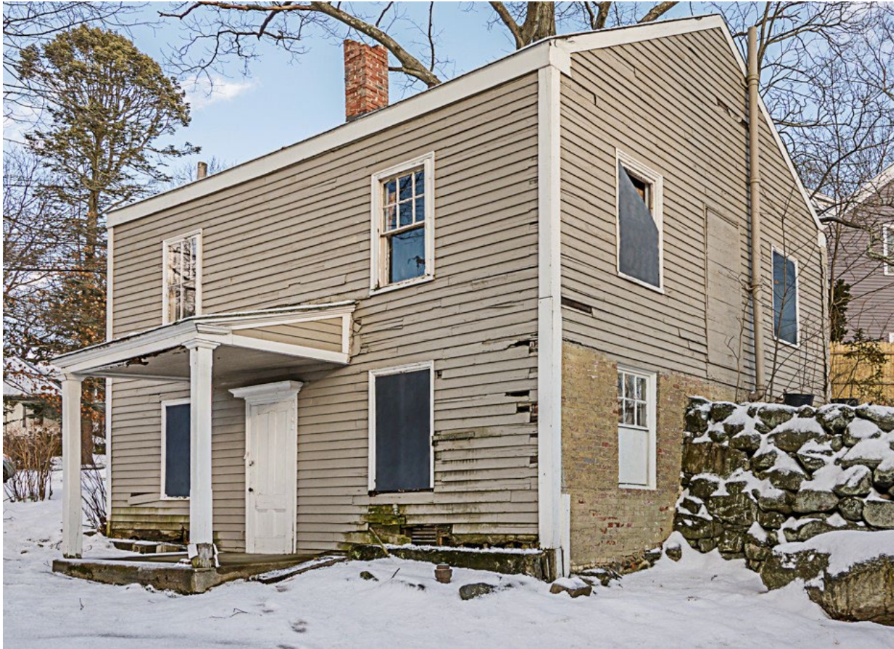
9 Oakland Street