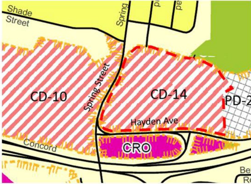
Figure 1- Existing