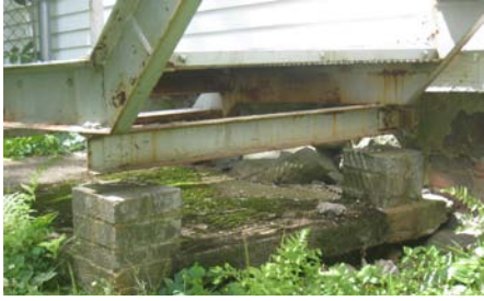
Figure 4: Fire escape footing before removal

The fire escape was removed, exposing a gap in the mortar at the foundation of the Stone Building. Though not large, because the site work had been removed from the contract the architect and owner discussed means of closing up the opening to prevent animals and water from entering the building. The Town was able to procure services for repointing the gap and installing the gravel drip along with hard plastic edging to keep the stones in place.