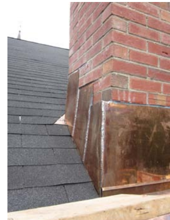
Figure 3: Shoulder at chimney

Because the layering of paint was so thick on the building it was deemed prudent to remove all paint – with reserve of some protected areas to preserve the historic paint sequence because new coats of paint over the existing would be subject to failure if the heavy underlayers lost adhesion. With the proximity of the adjacent church, school and daycare paint removal by mechanical means was prohibited and chemical stripping was done instead. The painters made multiple applications of SmartStripPro by Dumond Chemicals. Described as a low odor, low VOC paint stripper, the painter applied the material with brushes and allowed generous lengths of time for the stripper to dwell on the wood. Eventually the paint layers were removed down to bare wood. The removal task took several months and was essentially the only activity on the site since the other work was either above or below the paint work areas and would not be reachable during the paint removal process.