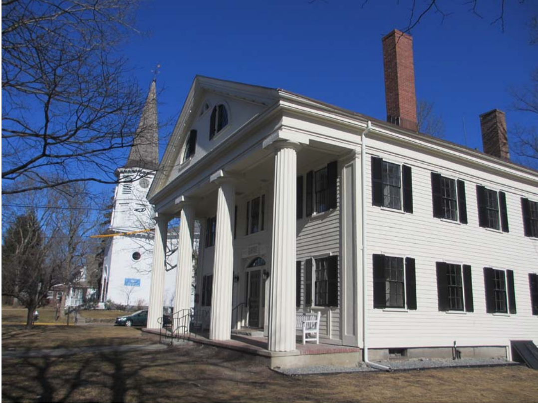
Figure 5: Restored facade and partial east elevation