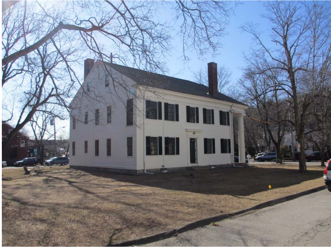
Figure 7: Restored rear and west elevations