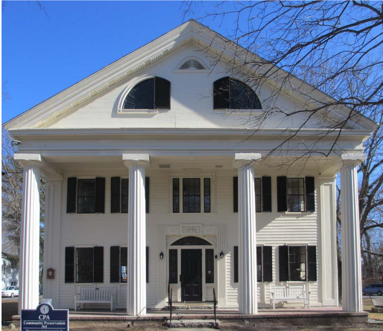
Figure 1: Restored facade