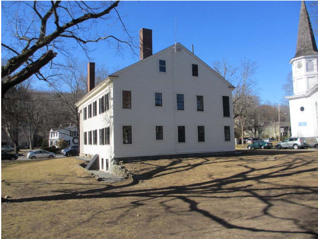
Figure 6: Restored rear elevation